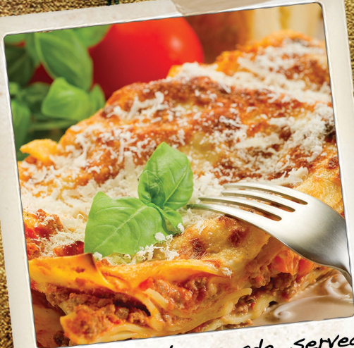
Lasagna- Homemade, served with fresh garlic bread $10.95

*May be cooked to order: Notice. .. Consuming raw or under cooked meats, poultry, seafood, shellfish or eggs may increase your risk of foodborne illness, especially if you have a medical condition