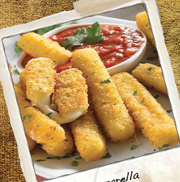
Mozzarella Sticks .. $6

*May be cooked to order: Notice...Consuming raw or under cooked meats, poultry, seafood, shellfish or eggs may increase your risk of foodborne illness, especially if you have a medical condition.