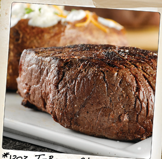
*12oz. T-Bone- Classic cut of prime beef, cooked to order, served with vegetables and baked potato $16.95

All entrees are served with your choice of soup or salad.