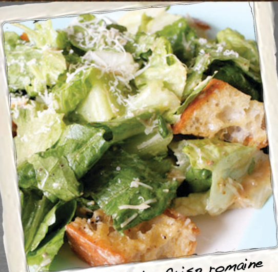
Caesar salad - Crisp romaine lettuce, tossed with parmesan cheese, Caesar dressing, and croutons. Half $5 Full $8

*May be cooked to order: Notice. .. Consuming raw or under cooked meats, poultry, seafood, shellfish or eggs may increase your risk of foodborne illness, especially if you have a medical condition.