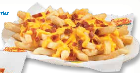
Bacon Cheese Fries