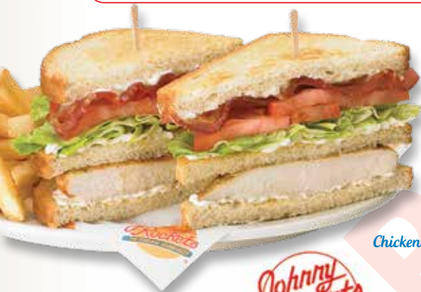
Chicken Club Sandwich

CHICKEN TENDERS Six lightly breaded, crispy chicken tenders with choice of dipping sauce. $7.89 1080-1680 Cal