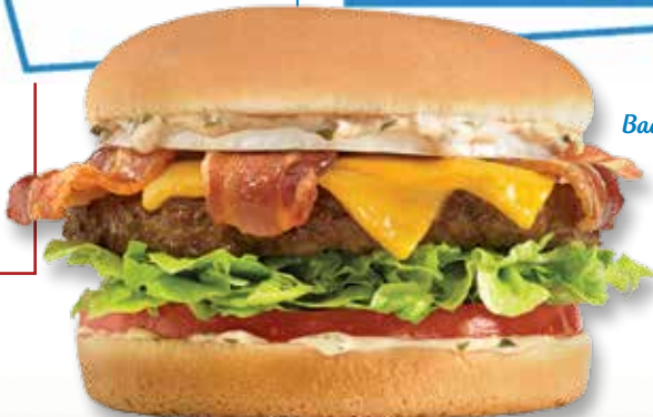
Bacon Cheddar Single

Substitute 100% Soy Boca® Burger 100 Cal, Turkey Patty 300 Cal, Grilled Onions 20 Cal, Wheat Bun 240 Cal or any cheese at no charge.