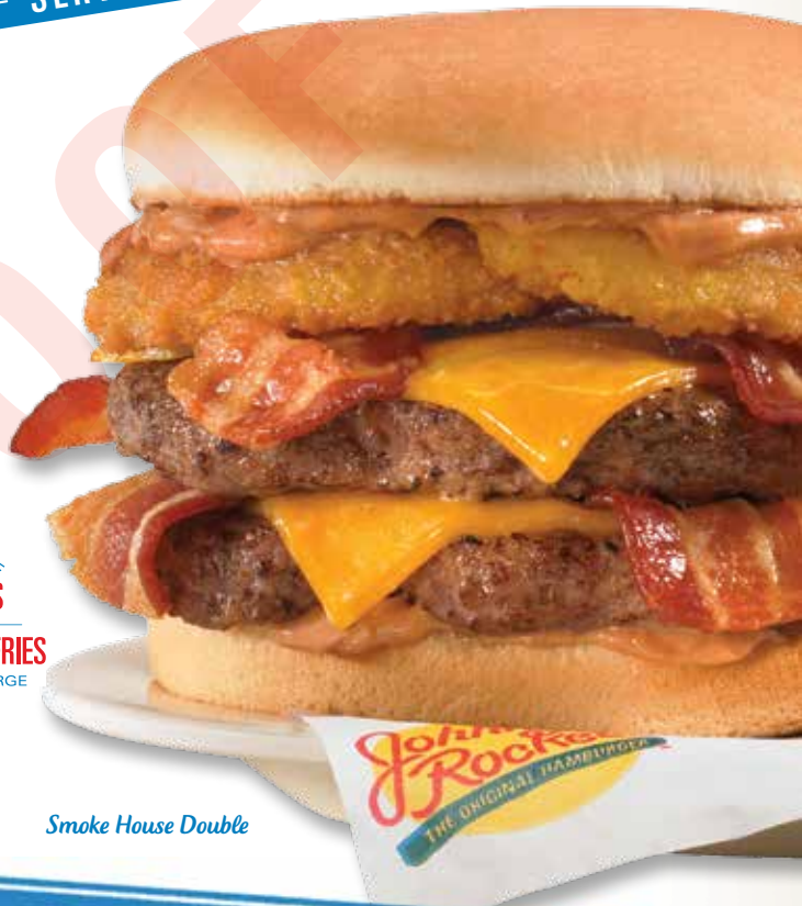
Smoke House Double

SUBSTITUTE ONION RINGS or SWEET POTATO FRIES *ADDITIONAL CHARGE