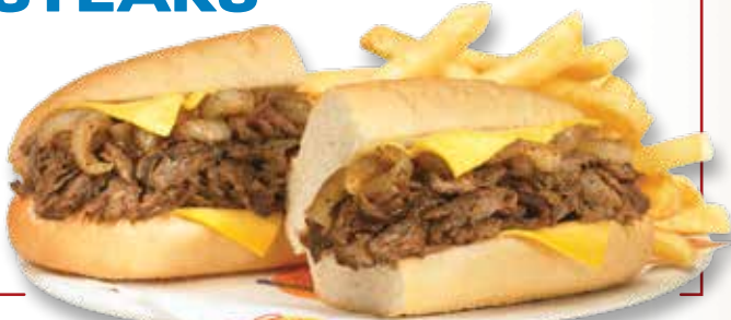
Philly Cheese Steak