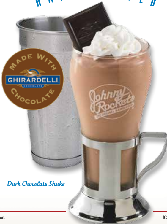
Dark Chocolate Shake