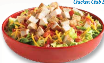
Chicken Club Salad