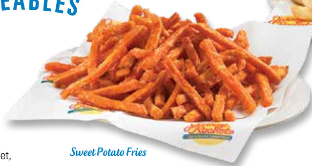
Sweet Potato Fries

CHILI BOWL Our exclusive home style, all-meat recipe. $3.99 610 Cal