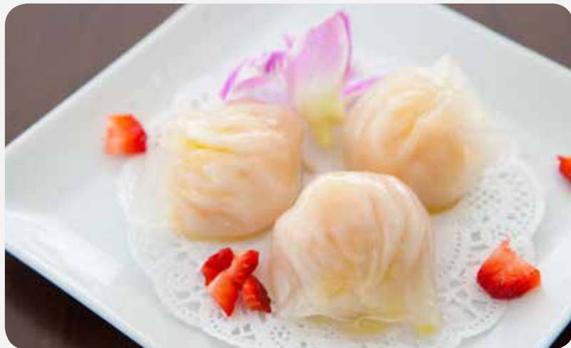
① Shrimp Dumpling 4.88 晶瑩鮮蝦餃