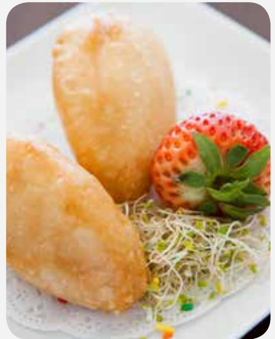
⑫ Deep Fried Pork Dumpling 3.88 家鄉鹹水角