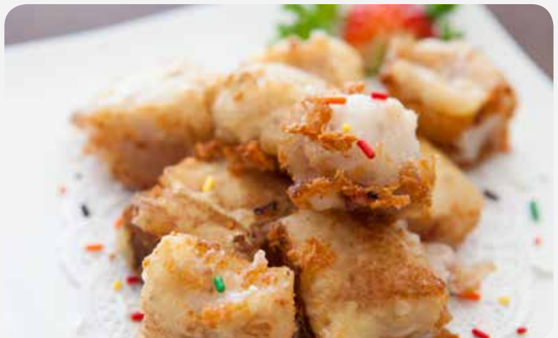
⑰ Pan Fried Radish Cake 4.28 家鄉蘿蔔糕