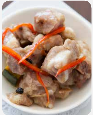
⑮ Spareribs in Black Bean Sauce 3.88 豉汁蒸排骨