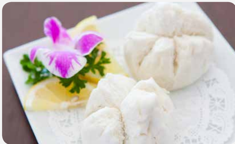
⑥ Chicken Bun 3.88 北菇滑雞包