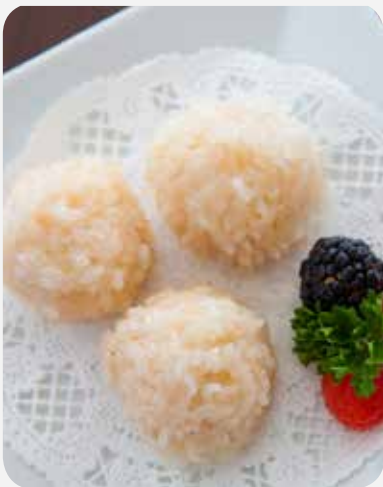
⑬ Shrimp Ball w/ Sticky Rice 3.88 珍珠鮮蝦丸