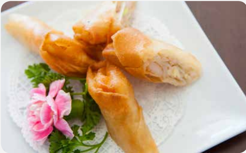
⑪ Deep Fried Spring Roll 3.88 韭黃炸春捲