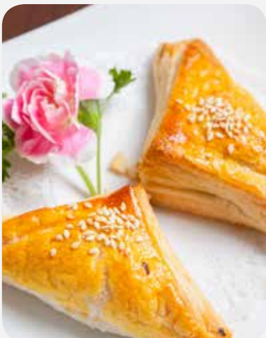
⑯ BBQ Pork Pastry 3.88 黃金叉燒酥