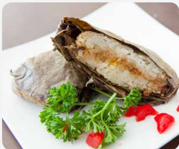
⑦ Sticky Rice Wrapped with Lotus Leaf 3.88 荷香珍珠雞