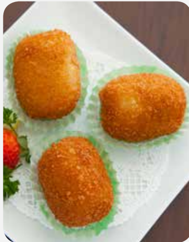
⑭ Curry Pastry 3.88 咖喱角