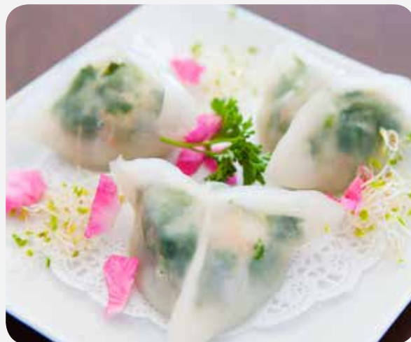
④ Shrimp Dumpling with Chives 4.88 鮮蝦韭菜餃