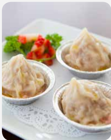
⑤ Juicy Pork Dumpling 3.88 上海小籠包