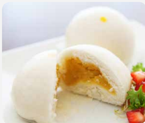
⑧ Steamed Creamy Custard Bun 3.88 香滑奶黃包