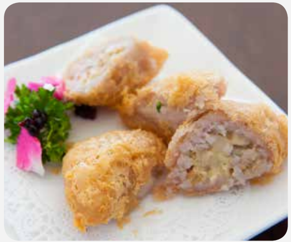
⑩ Deep Fried Taro Dumpling 3.88 蜂巢荔芋角