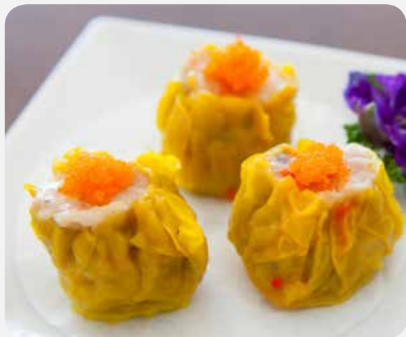
③ Pork & Shrimp Dumpling 3.88 蟹黃蒸燒賣