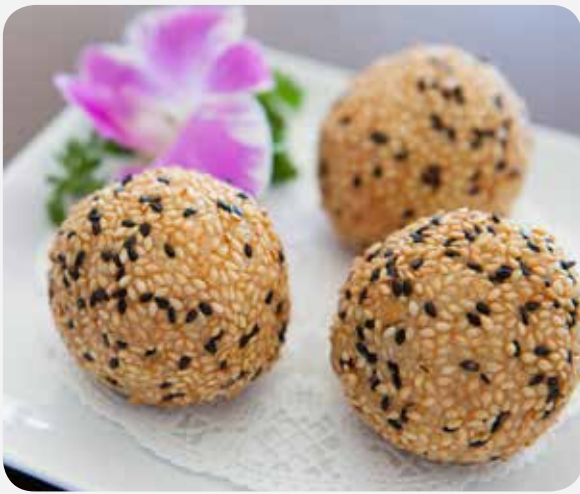
⑨ Fried Sesame Ball 3.88 香脆芝麻球