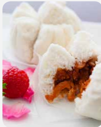
② Baked BBQ Pork Bun 3.88 蜜汁叉燒包