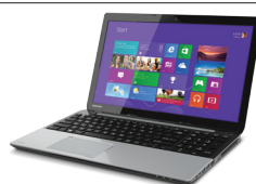
Satellite ® L55 Series Laptops