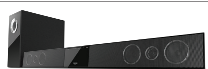
SBX4250 Sound Bar

1. While every effort has been made at the time of publication to ensure the accuracy of the information provided herein, product specifications, configurations, system/component/options availability are subject to change without notice. 2. 1080p/24 fps encoded content and an HD display capable of accepting a 1080p/24Hz signal required for viewing 1080p/24 fps content. 3. Use of HDMI ® -CEC requires an HDMI ® -CEC compatible display/peripheral device. Depending on the specifications of your device, some or all HDMI ® -CEC functions may not work even if your display/peripheral device is HDMI ® -CEC compatible. 4. If you decide to wall mount your Toshiba television, always use a UL Listed wall bracket appropriate for the size and weight of the television. Care should be taken to place or install the display where it cannot be pushed, pulled over, or knocked down.