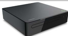
Symbio ™ BDX3500 Streaming Media and Universal Disc Player