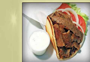
*ALL SANDWICHES SERVED WITH FRIES*