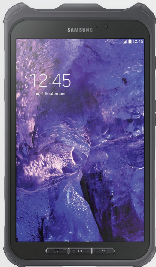
Galaxy Tab ® Active (WiFi)

AN EVERYDAY RUGGED TABLET FOR ENTERPRISE WORKFORCES