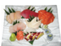
7 kind of Sashimi $43.95