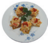
Crab Salad $4.95