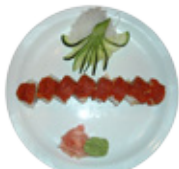
New York Roll $10.95 Spicy salmon, avocado & spicy tuna.