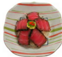
Pepper Tuna $11.95 Pan seared tuna rubbed with peppercorn and served with Ponzu sauce.