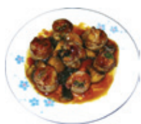
Beef Negima $11.95 Grilled sliced tender beef roll with green onion and carrots.