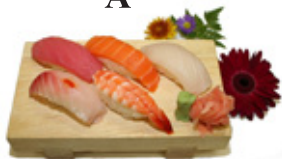
5 kind of Sushi $10.95

Tuna, yellow tail, salmon, shrimp & white fish.