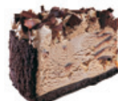
Mississippi Mud $6.95

Attention: Consuming raw or undercooked meats, poultry, seafood, shellfish or eggs may increase your risk of food borne illness especially if you have medical conditions.