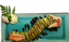
Caterpillar Roll $11.95 Eel, avocado & shrimp decoration.