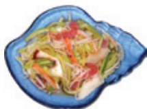
Spicy Seafood Salad $7.50 Mixed fish, crabmeat, cucumber & spicy ponzu sance.