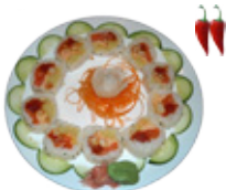
Louisiana Roll $14.95 Spicy tuna, spicy salmon, spicy crawfish, crunch & avocado. (Big Roll)