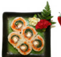
Tiger Eye Roll $8.95 Smoked salmon, cheese & jalapeno. Seaweed paper & soy paper.