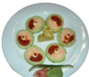
Snow Crab Navodo $11.95 Snow crab wrapped with cucumber, Spicy Tuna & Avocado.