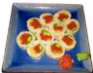
Spicy Boy Roll $12.95 Spicy tuna, crunch, avocado, wasabi, tobiko. Soy bean paper.