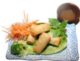
Harumaki $4.25 Crispy traditional Japanese vegetable spring rolls.