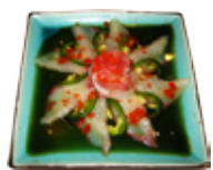
Rose Snapper $11.95 Red snapper, jalapeno, massago, spicy ponzu sauce.