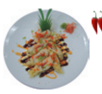
Phoenix Roll $10.95 Tuna, salmon, yellow tail, avocado, wrapped with soy paper. Lightly fried.