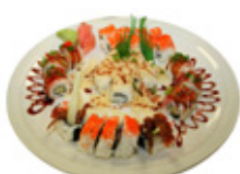
Deluxe Maki Combo $30.95

Spicy salmon roll, spider roll, tura crunch roll & shaggy dog roll.