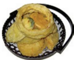
Vegetable Tempura $6.95 8 pc fried vegetables.