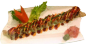
Cypress Roll $13.95 Shrimp tempura, cream cheese, jalapeno (inside) Deep fried with pepper tuna & avocado