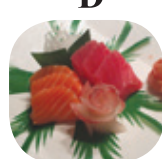
3 kind of Sashimi $19.95