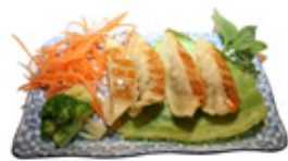
Gyoza $4.25 Japanese pan fried dumplings.