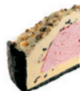
Banana Split $6.95