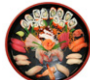
Shogun Love Boat $69.95

For 3 people. 15 pieces premium sashimi, 12 pieces sushi, rainbow roll & shaggy dog.