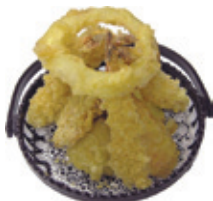
Shrimp Tempura $9.95 4 pc shrimp and 4 pc vegetables.