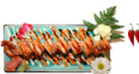
Shaggy Dog $10.95 Shrimp tempura, crab meat, and sesame with Shogun special sauces. (Best Seller)