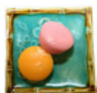
Japanese Mochi Ice Cream $3.50 for two pieces Ask server for flavors