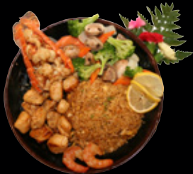
Chicken & Lobster