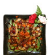
Tornado Roll $11.95 Shrimp tempura, avocado inside, wrapped with fried potato string. Seaweed paper & soy paper.