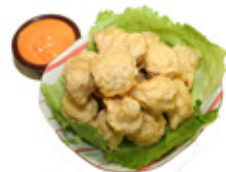
Fried Mushrooms $5.95