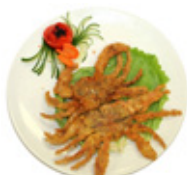
Soft Shell Crab $9.95 Deep fried soft shell crab.