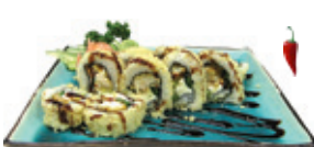
Chicken Crunch Roll $9.95 Chicken tempura, cream cheese, jalapeno, avocado & crunch.