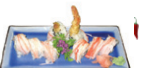
Shogun Roll $12.95 Shrimp tempura, cream cheese, crabmeat & jalapeno.