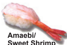
Amaebi/ Sweet Shrimp