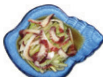
Tako Su $6.95 Octopus & cucumber.