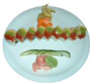
Boston Roll $12.95 Eel, avocado, spicy tuna, snow crab & wasabi tobiko.