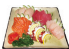
5 kind of Sashimi $33.95