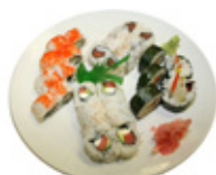
Maki Combination $22.95

California roll, philadelphia roll, spicy tuna roll & japanese vegetable roll.