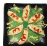
Honey Moon $9.95 Jalapeno, cream cheese with snow crab.