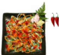
Volcano Roll $10.95 White fish inside. Deep fried with special sauces.