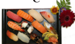
11 kind of Sushi $23.95

#B items plus mackerel, squid, surf clam & smoked salmon.