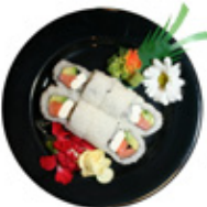
Philadelphia Roll $5.95 Cream cheese, smoked salmon & avocado.