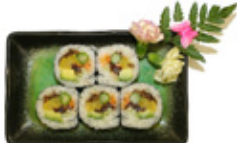
Japanese Veg. Roll $6.95 Asparagus, mushroom, carrot, cucumber & avocado...