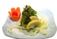
Seaweed Salad $4.50