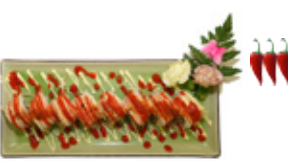
Spicy Crawfish Roll $12.95 Spicy crawfish, crabmeat & spicy sauces.