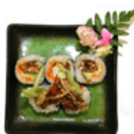
Spider Roll $8.95 Deep fried soft shell crab, cucumber, avocado & smelt egg.