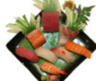
3 Sashimi + 5 Sushi $29.95

Sashimi – tuna, salmon & white fish Sushi – #g items plus salmon.