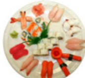
Kiri Sushi Combo $44.95

For 2 people. 16 pieces sushi, California roll & spicy tuna roll.