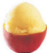
Mango Fruit $6.95