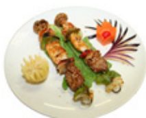
Robata A $10.95 Beef, shrimp, vegetable. Robata B (11.95) beef, shrimp scallops, chicken. Robata Beef (9.95), Robata Shrimp (9.95)