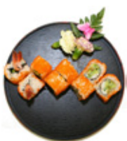
Shrimp Roll $5.95 Shrimp, avocado, cucumber & smelt egg.