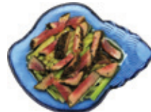
Pepper Tuna Salad $7.95 Pepper tuna & cucumber