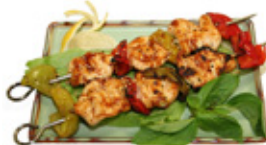
Chicken Yakitori $6.50 Grilled chicken skewers with Yakitori sauce.