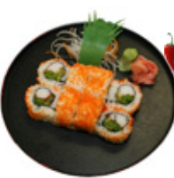
Texas Roll $5.95 Crab meat, cucumber, jalapeno & smelt egg.