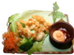
Crabmeat Puff $4.75 Crab meat with cream cheese.