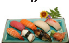
7 kind of Sushi $14.50