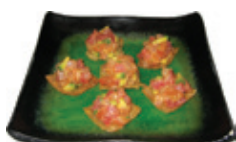
Tar Tar $8.95 Tuna, salmon, yellow tail, avocado and spicy mayo.