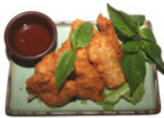
Chicken Katsu $5.95 Deep fried breaded chicken.