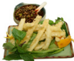
Spicy Calamari $8.95