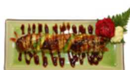
Dragon Roll $11.95 Crab meat, avocado, cucumber & eel.