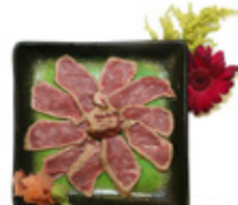
Beef Sashimi $11.95 Pan seared steak with Ponzu sauce.