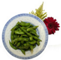
Edamame $3.75 Boiled fresh garden soybean, seasoned with sea salt.