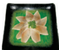
Albocore Tataki $11.95 Seared white tuna