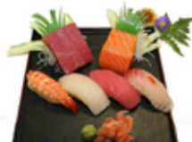
2 Sashimi + 4 Sushi $20.95

Sashimi – tuna and salmon Sushi – tuna, yellow tail, shrimp & white fish.