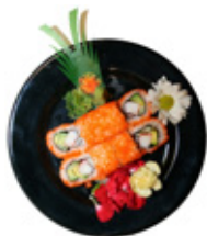
California Roll $4.95 Crab meat, avocado, cucumber & smelt egg.