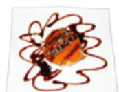
Baked Salmon $7.95 Salmon, snow crab, masago, sesame seeds, baked with ell sauce.