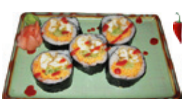
Spicy Calamari Roll $7.95 Calamari tempura, cucumber, snow crab, smelt egg & crunch.