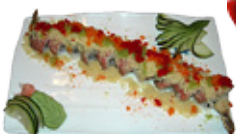
Fantasy Roll $12.95 Shrimp tempura, eel, crunch, pepper tuna, 3 kind of fish eggs.