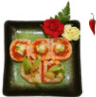
Crazy Roll $9.95 Spicy tuna, shrimp tempura, avocado & cucumber. Soy paper.