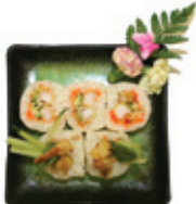
Rock n Roll $8.95 Shrimp tempura, avocado, cucumber & smelt egg. Soybean paper.