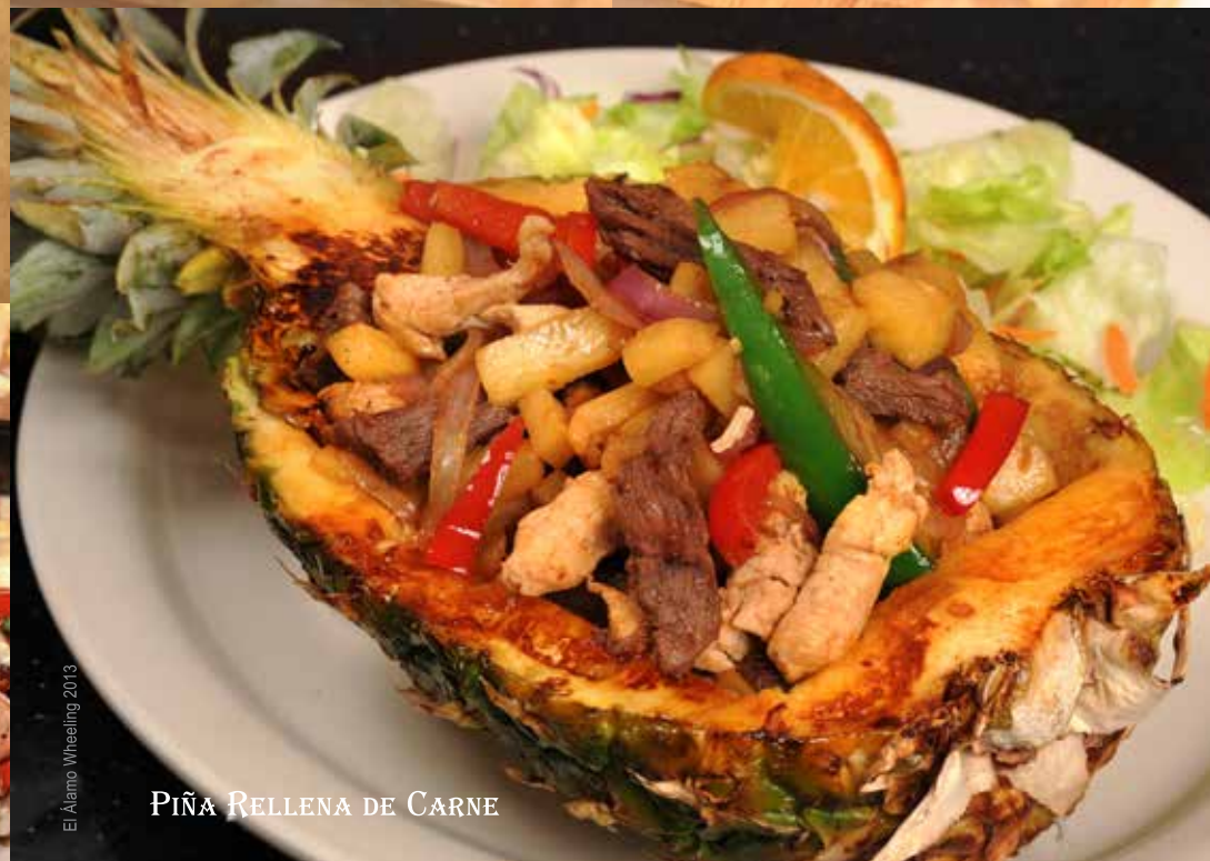
PIÑA RELLENA DE CARNE