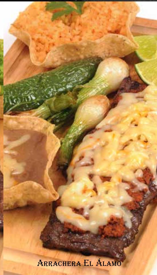
ARRACHERA EL ÁLAMO