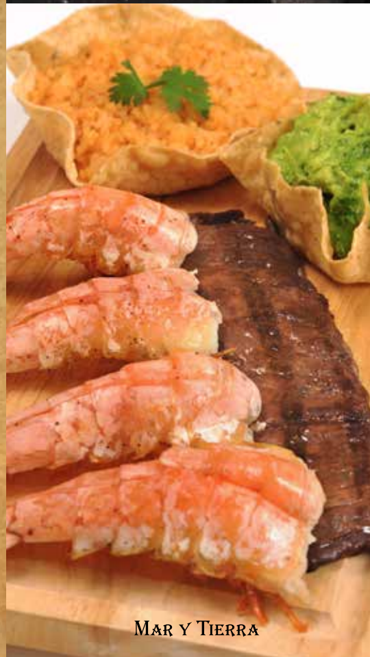
MAR Y TIERRA