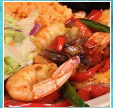
FAJITAS DE CAMARÓN