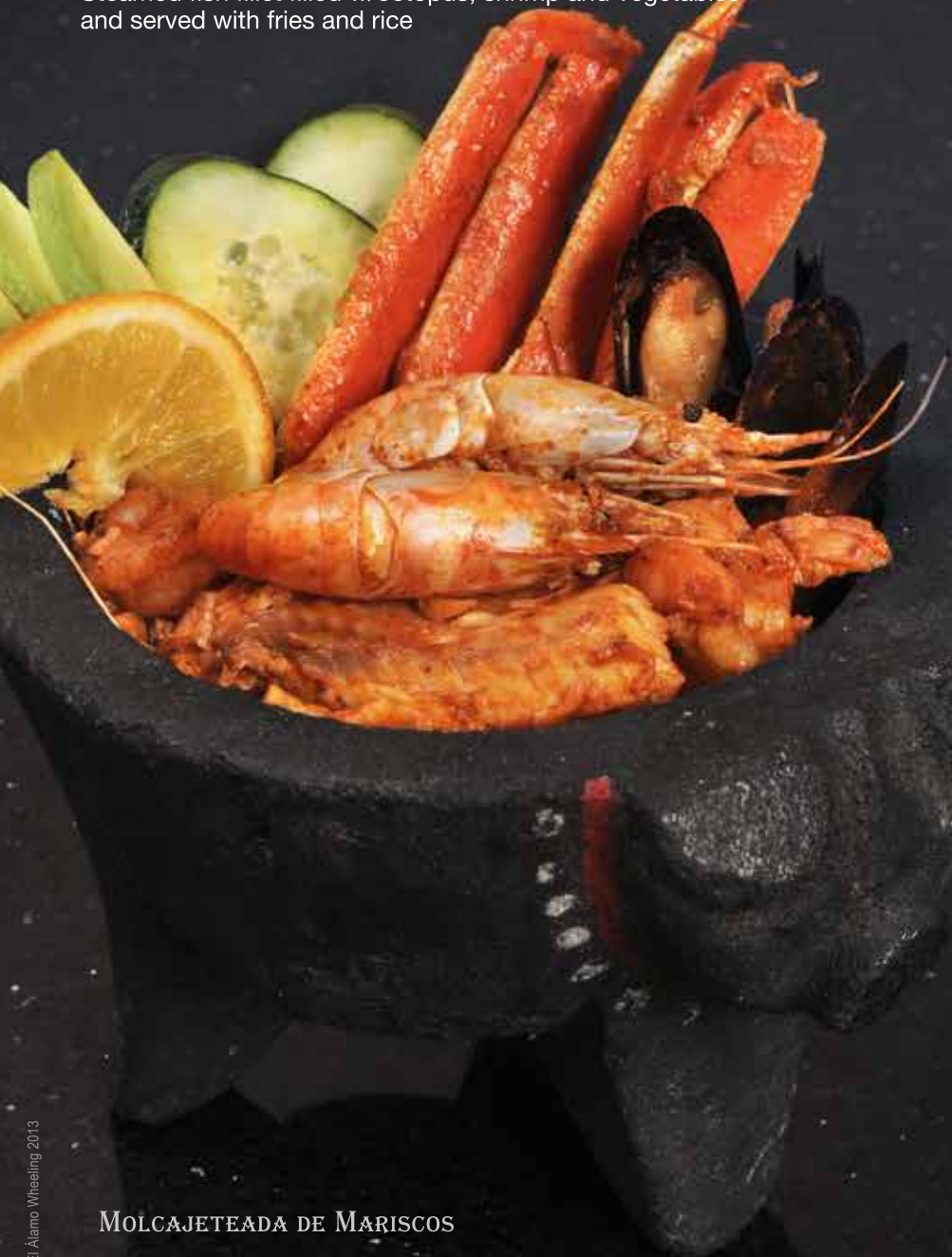
MOLCAJETEADA DE MARISCOS

Steamed fish fillet filled w/ octopus, shrimp and vegetables and served with fries and rice