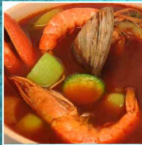
SOPA DE MARISCOS