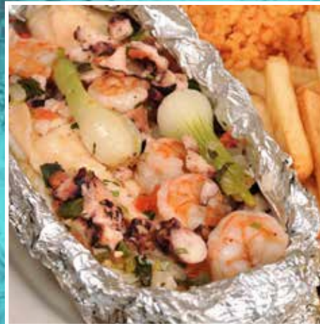
EMPAPELADO DE MARISCOS