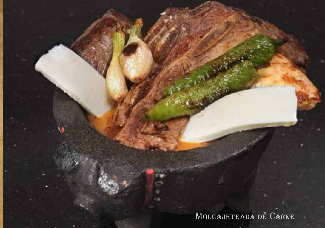
MOLCAJETEADA DE CARNE