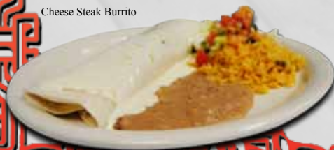
Cheese Steak Burrito