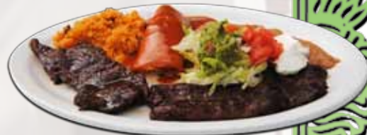
Las Piramides Dinner