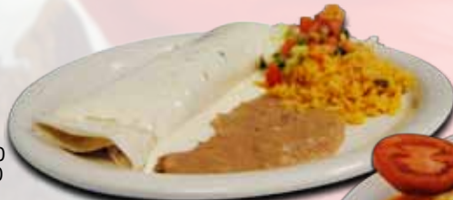
Cheese Steak Burrito

(Two chicken taquitos with rice and beans).....$5.99