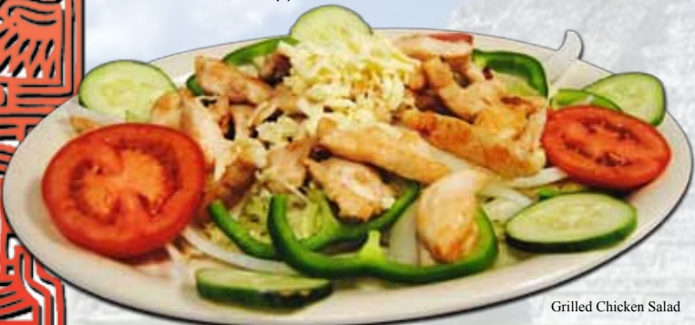
Grilled Chicken Salad

FAJITA SALAD (crispy flour tortilla with lettuce, tomatoes and shredded cheese, add grilled chicken or steak, add $1.00 for shrimp).....$10.99