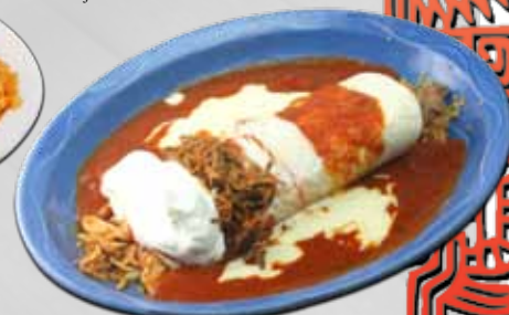
Hot & Spicy Burrito