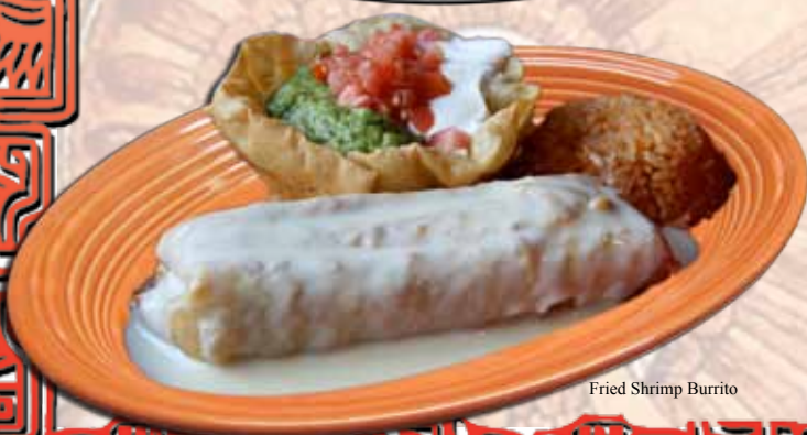
Fried Shrimp Burrito

6. SPINACH ENCHILADAS (three spinach enchiladas served with lettuce, cheese, sour cream and rice.).....$9.50