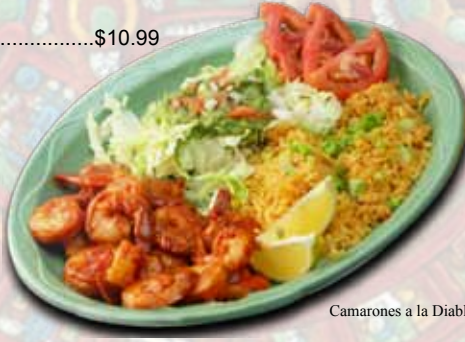
Camarones a la Diabla