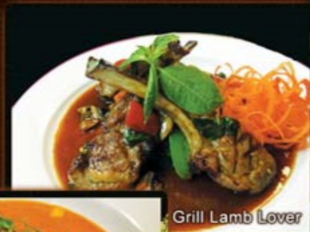
Grill Lamb Lover