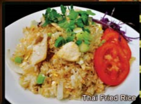
Thai Fried Rice

An 18% gratuity [or service charge] will be add to parties of 5 or more.