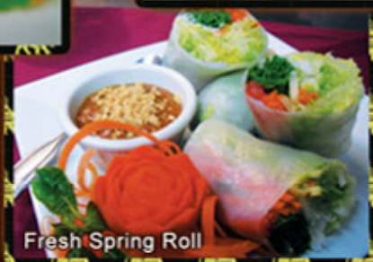
Fresh Spring Roll