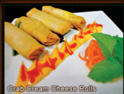
Crab Cream Cheese Rolls