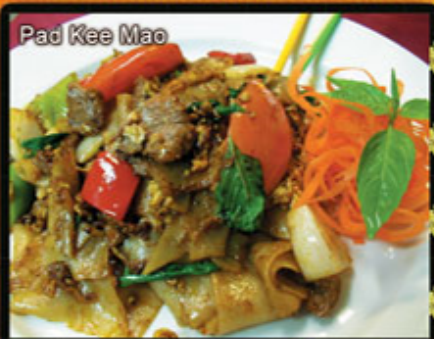
Pad Kee Mao

Red curry with pineapple, bell peppers, fresh basil and tomatoes