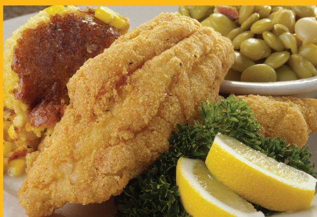
US Farm-Raised Catfish

Fresh Baked Yeast Rolls • Iron Skillet Cornbread Mexican Skillet Cornbread