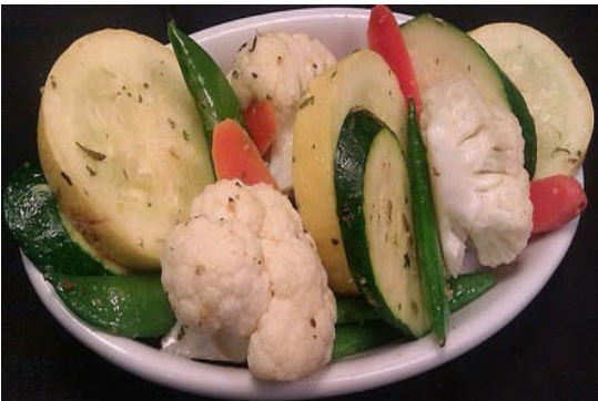
STEAMED VEGETABLES Snow Peas, Carrots, Zucchini, Squash, Cauliflower