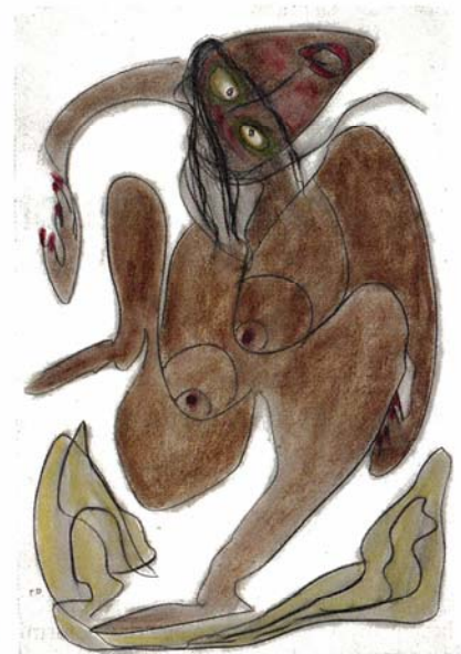
African Athlete, 1998

to grips with the struggles of black people over the years and the predicaments and ragged glories of American life generally.