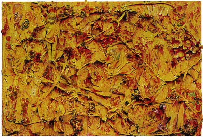
The Beginning of Life in the Yellow Jungle, 2003