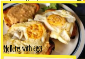
Molletes with eggs