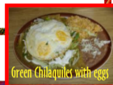
Green Chilaquiles with eggs