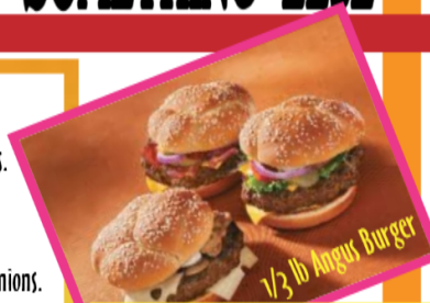
1/3 lb Angus Burger

Open grilled Ciabata bread topped with refried beans, chicken fajita and melted cheese.