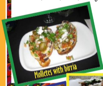
Molletes with birria