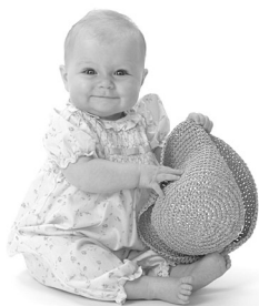
Black & White