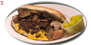
Hoagie with cheese & mushrooms

Mushrooms or hot peppers add .60 per item