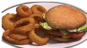
King Burger with side of Onion Rings

Swiss and American cheese, crisp fresh lettuce, sliced tomato and mayonnaise.