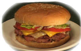
Queen - Hot Ham Sandwich

Best burger you can get on a 3" bun! Cheese, mustard, ketchup, pickle & grilled onion.