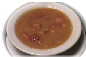
Bean Soup with Ham