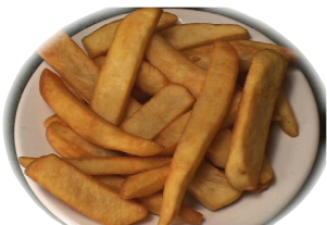
Steak Cut French Fries