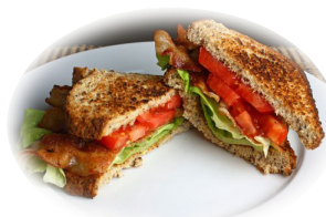
B. L. T.