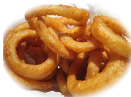
Batter Dipped Onion Rings