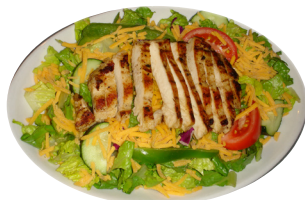
Grilled Chicken Salad