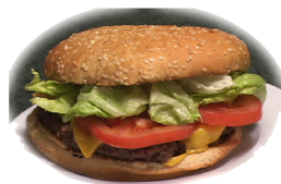
Signature Ace Burger

Cheese, crisp fresh lettuce, sliced tomato, mayonnaise and grilled onion.