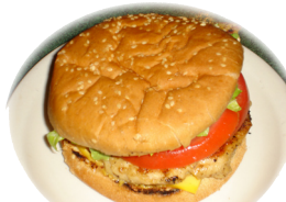
Grilled Chicken Sandwich

Sliced ham, Swiss and American cheese, onions, crisp lettuce, sliced tomato and mayonnaise. Hot pepers available. Served hot or cold.