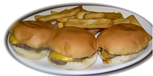
3 Deuce Burgers with Fries

Marinated chicken breast, cheese, crisp fresh lettuce, sliced tomato and mayonnaise.