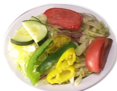
Tossed Dinner Salad