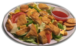
Crispy Chicken Salad

Romaine, crisp lettuce, fresh tomato, cheese, sirloin and dressing.