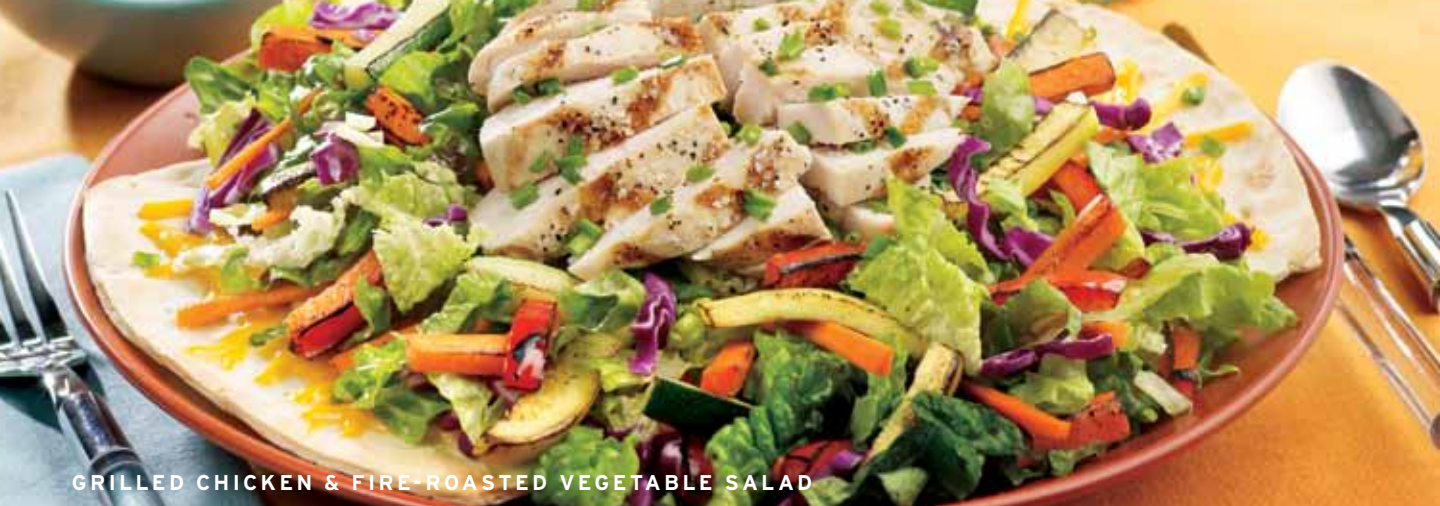
GRILLED CHICKEN & FIRE-ROASTED VEGETABLE SALAD