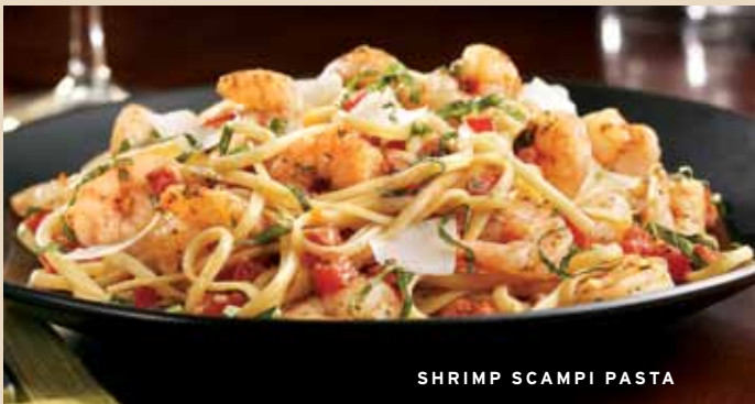
SHRIMP SCAMPI PASTA

A generous portion of shrimp lightly sautéed with garlic, fresh basil, tomato pesto and a hint of chipotle. Served over linguine and topped with shaved Asiago cheese. 14