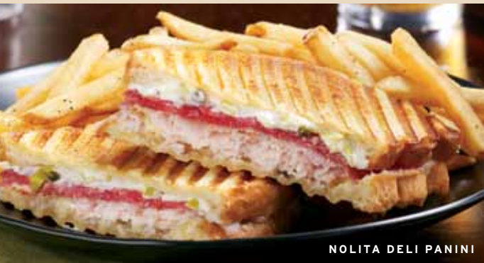
NOLITA DELI PANINI

Each sandwich is served with French fries and a pickle. Add a cup of soup or dinner salad for just 2 dollars.