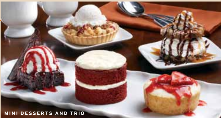
MINI DESSERTS AND TRIO