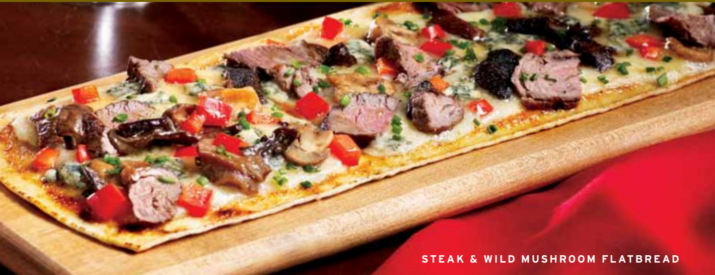
STEAK & WILD MUSHROOM FLATBREAD

But the Tony Roma’s story does not end with ribs. Crisp, fresh salads, mouth watering char-grilled steaks, and delicious, custom-topped seafood make up a menu that is sure to please.