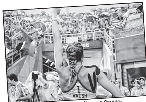
Kerry Walsh in last Olympic Games- Women's Volleyball, wearing Kinesio Tape

With much appreciation, we thank all our patients who voted for us!!