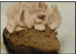
CHOCOLATE CHOCOLATE CREAM PIE

A chocolate lovers delight! Smooth dark chocolate fudge covered with milk chocolate mousse and topped with chocolate whipped cream in chocolate cookie crust