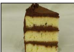
YELLOW CAKE DELUXE

Filled with pastry cream and dipped in chocolate