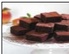
BIG A$$ BROWNIE

Chocolate cookie crust surrounds a rich, creamy chocolate-toffee mousse. Topped with more toffee and drizzled with chocolate ganache