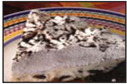
COOKIES AND CREAM PIE