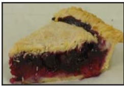
MIXED BERRY PIE

Oodles of tart orchard cherries, sugar and spices piled high in a tender, flaky crust