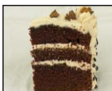
PEANUT BUTTER CAKE

A rich, dark chocolate torte with the smoky depth of espresso and the creamy texture of fudge Contains no flour.