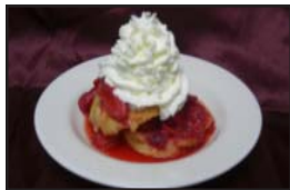
STRAWBERRY SHORT CAKE