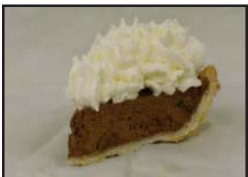
FRENCH SILK PIE

Start with a dark cookie crust, top with creamy layers of chocolate and mint fillings and chocolate whipped cream, then finish off with chocolate curls