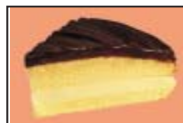
BOSTON CREAM PIE