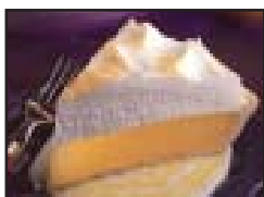
LEMON MERINGUE PIE

Creamy banana custard with fresh banana slices crowned with whipped cream