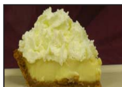
FLORIDA KEY LIME PIE