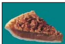
SOUTHERN PECAN PIE

Loaded with moist coconut shreds, from the sweet filling to the whipped cream top