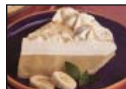
BANANA CREAM PIE