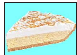
COCONUT CREAM PIE