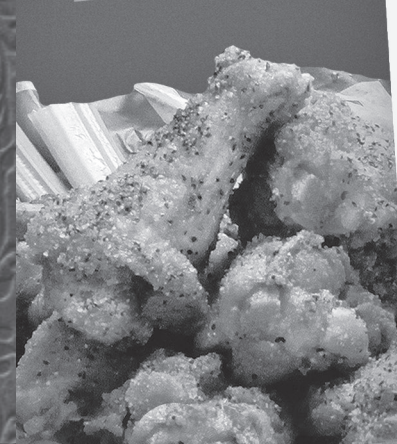
Lemon Pepper Traditional Wings