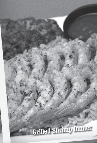
Grilled Shrimp Dinner

BEEF 'O' BRADY'S GOOD FOOD, GOOD SPORTS™