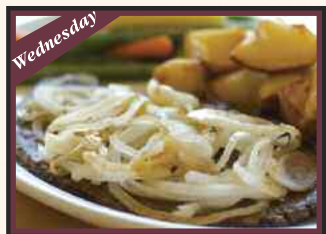
Liver and Onions - $9.99