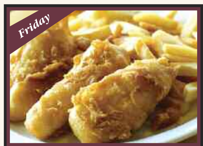
All You Can Eat Fish & Chips - $13.99

GIVE THE GIFT OF ANGIES - Gift Certificates available for any occasion