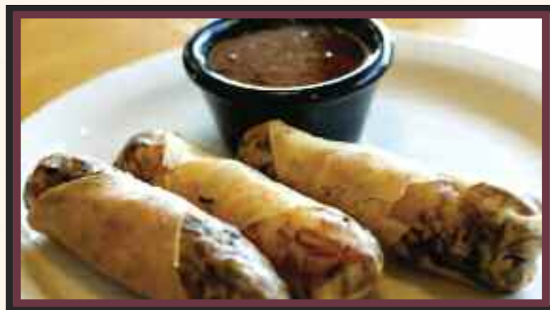
Spring Rolls & Thai Dressing