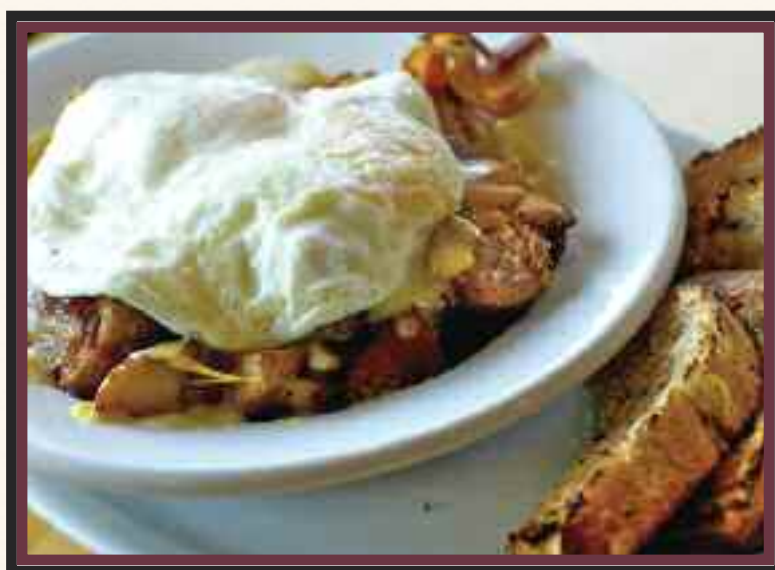
Angie's Famous Melt

Two eggs any style with baked beans and fresh tomatoes . . . . . $6.50 Add grilled tomatoes . . . . . $0.99