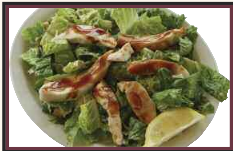
BBQ Chicken Strips & Caesar Salad