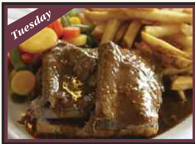
Hot Beef - $9.99

Served with garden salad or cole slaw, grilled vegetables, choice of French fries, home fries or mashed or rice