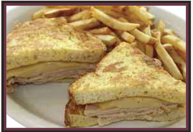
Monte Cristo Sandwich

On Angie's homemade white or brown bread . . . . . $6.50 add Caesar or Greek Salad . . . . . $1.99 add sweet potato fries . . . . . $1.50