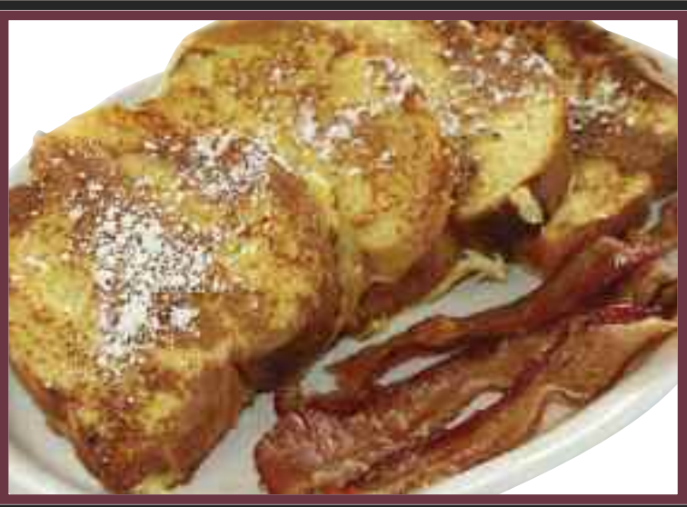
French Toast & Bacon

Add peameal bacon or Krug's farmer sausage ....$3.95