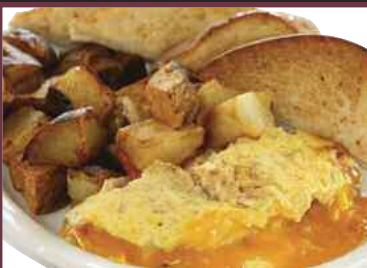
Angie's Own Omelette

Add the following items for 99¢ each: onions, mushrooms, peppers, hot peppers, ham, feta cheese, cheddar cheese, bacon, fresh or grilled tomatoes, sundried tomatoes, black olives, side of salsa, extra egg