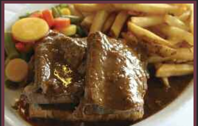
Hot Beef Sandwich