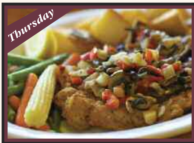
Hunter Schnitzel - $10.99