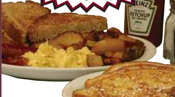
Angie's Breakfast Special