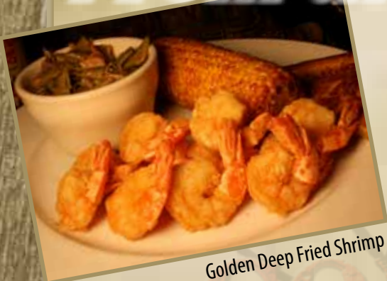
Golden Deep Fried Shrimp