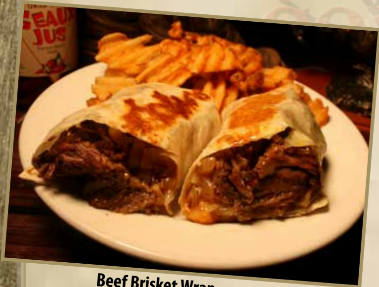
Beef Brisket Wrap

This one is a local favorite . . . our smoked Texas brisket wrapped up with sautéed onions and shredded Cheddar cheese. $9.29