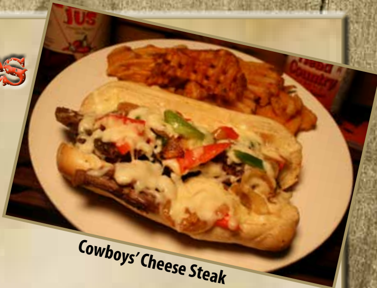
Cowboys' Cheese Steak

We use our special brisket rub from Luckenbach, Texas season these briskets. We smoke 'em for 12 hours 'til they turn a great mahogany, then we pull it against the grain and put it on your plate. Regular $9.29 "Big Daddy" $9.99