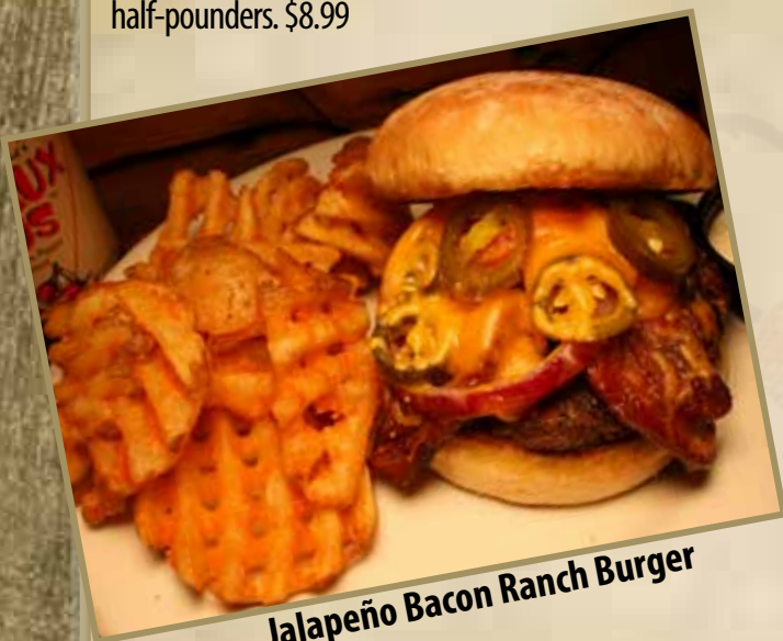
Jalapeño Bacon Ranch Burger

Smoked bacon, Cheddar cheese, red onion and jalapeños - all stacked on a tasty tender beef burger. Served with Cowboys' sauce. $9.49