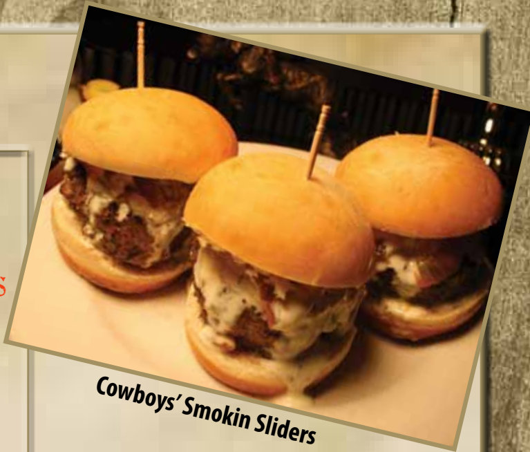
Cowboys' Smokin' Sliders